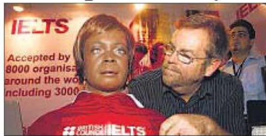
People lined up to catch a glimpse of BINA 48, an American robot often called the world's most socially interactive robot.

With a footfall of more than 35,000, the festival saw wall arts and paintings by Polish mural-